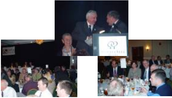
2007 Edward Teller Lecture/Banquet