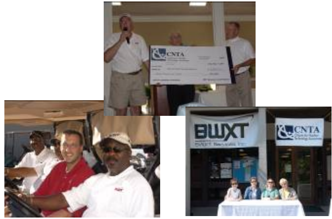
2007 CNTA Golf Tournament