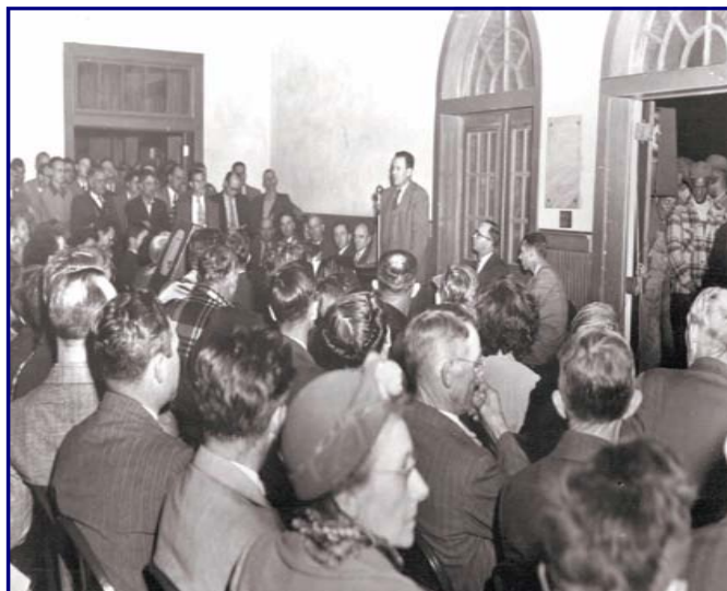
Public meeting at Ellenton Auditorium, December 6, 1950, called for by the U.S. Corps of Engineers real estate officers responsible for land acquisition. Representatives from each family were asked to attend. Reportedly, over 500 individuals attended the question and answer session.

The announcement was welcomed with joy and great anticipation in the CSRA. There was also an uneasiness and foreboding in the small communities that would be displaced by the giant project.