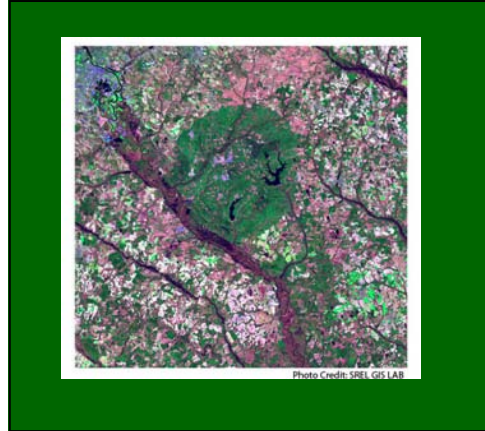
THE 'GEM' OF THE CSRA TAKEN FROM SPACE, 1997

HISTORY...EXHIBITS...SCIENCE...PRESENTATIONS...LIVE ANIMALS & BIRDS