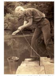
Dr. Eugene Odum