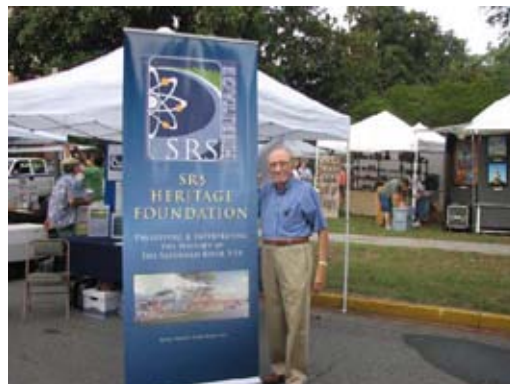
Display exhibit at Savannah River National Lab