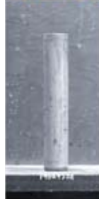
Thorium slug ready for shipment to P Area reactor for irradiation to produce uranium-233 (1962)