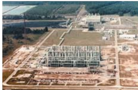
Aerial view of 400 Area after dismantlement of 411-D, only the tower's cylindrical foundations remain. 412-D was the last group of original GS towers to operate.