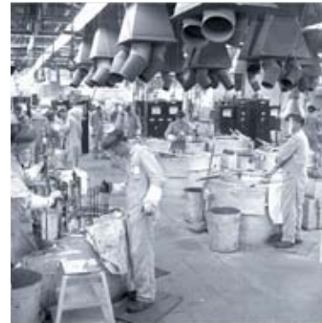
Interior of Canning Building (1958)