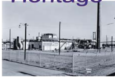
Building 232-F, the first tritium facility at Savannah River (1953)